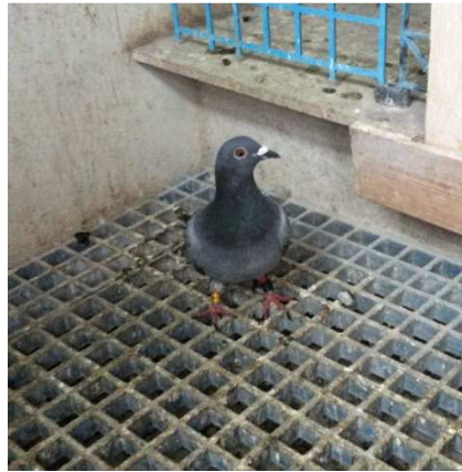
2 nd section F for Ian Ross