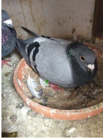
1 st section F for Ian Ross Kirkintilloch