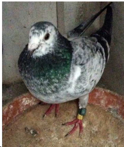
The 3 rd Section winner for Ian Ross