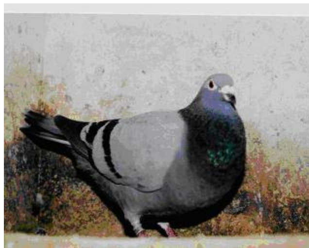
1st Open Nantes 596mls