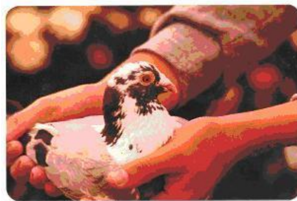
The Old Pol Bostyn Stock Cock